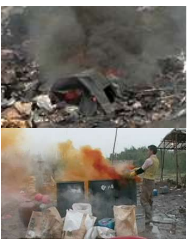
Acid leaching, wet chemical processing, heat treatment for metal recovery