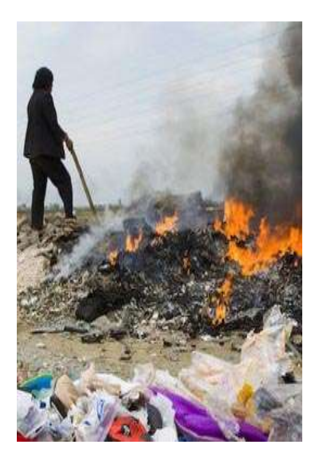
Burning of PVC cables to recover copper